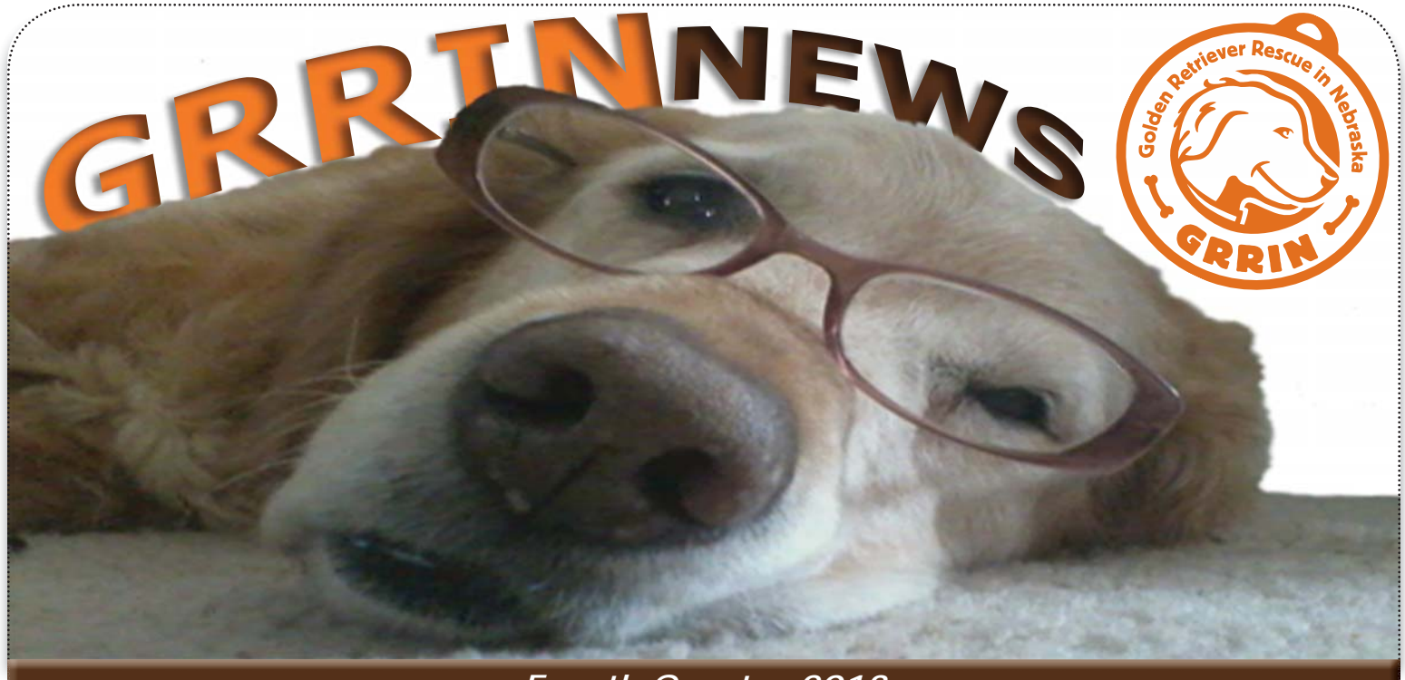
Fourth Quarter 2013